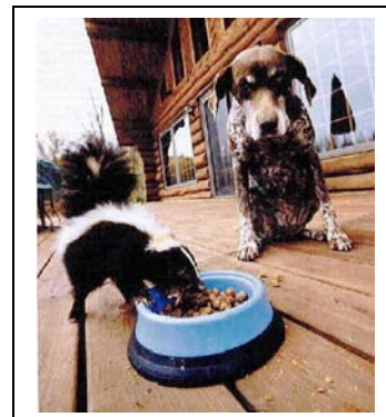
'A Lesson in Patience & Wisdom'

~ A busy person never has time to be unhappy ~